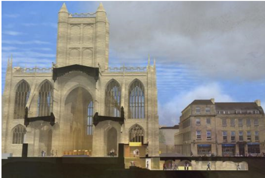
An artist's impression of a cross section below the Abbey showing the new spaces and how they relate to the footprint of the Abbey Church.