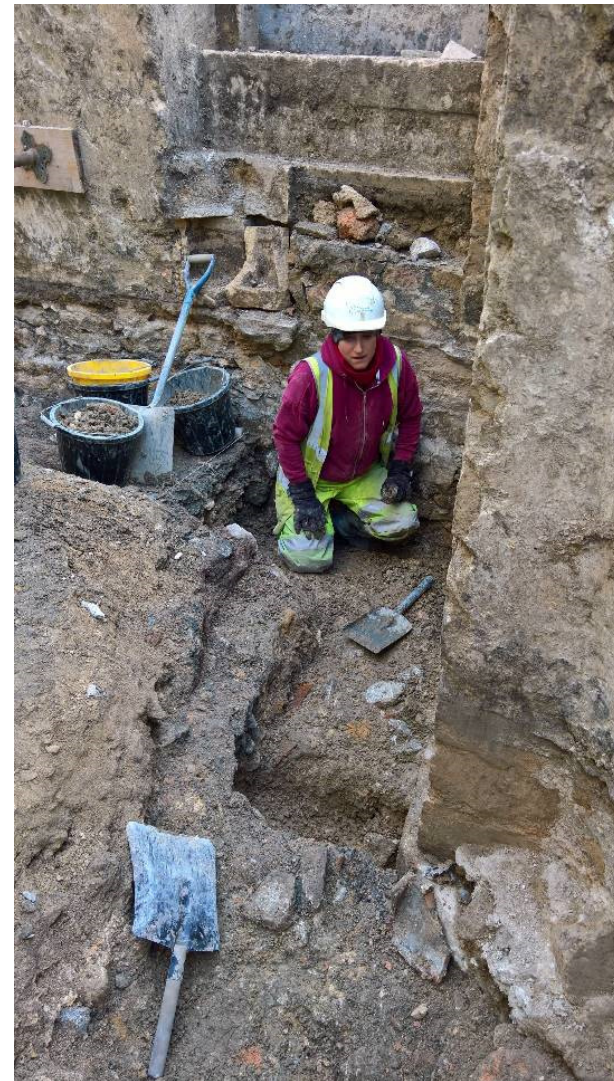
Detailed archaeological recording by Cotswold Archaeology of foundations on the south side of Bath Abbey Feb 2017.