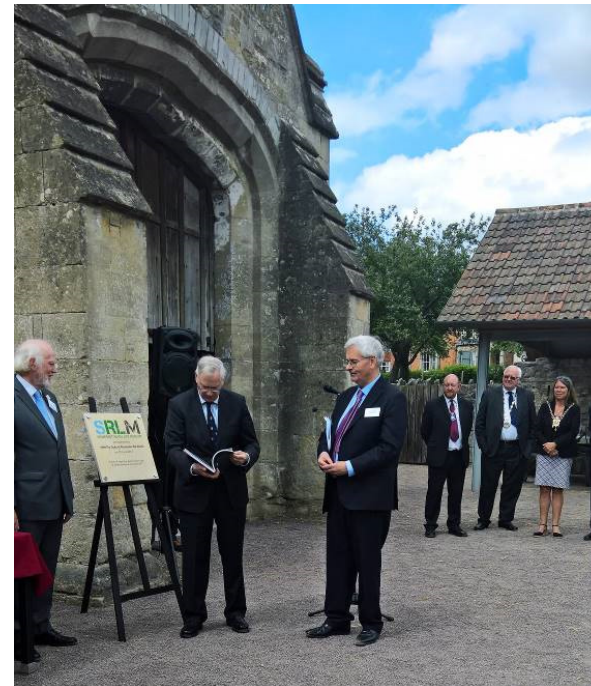
The opening ceremony at the Abbey Barn