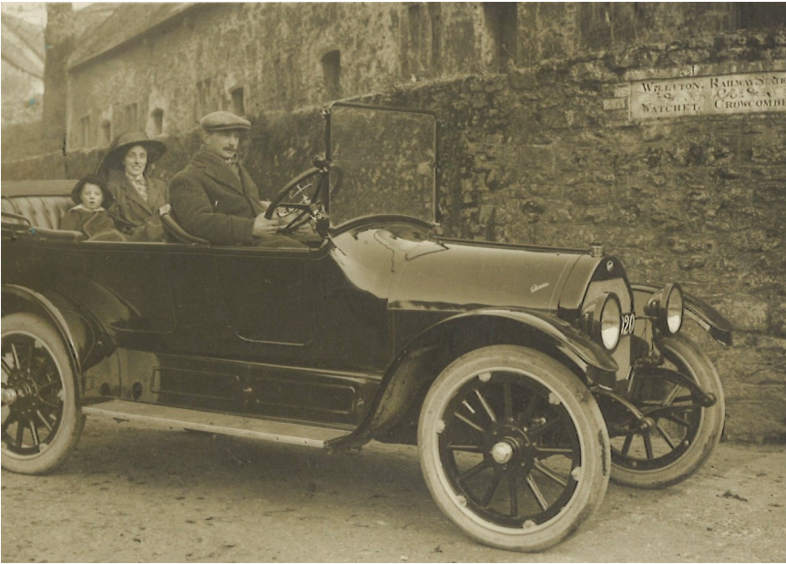
South West Heritage Trust