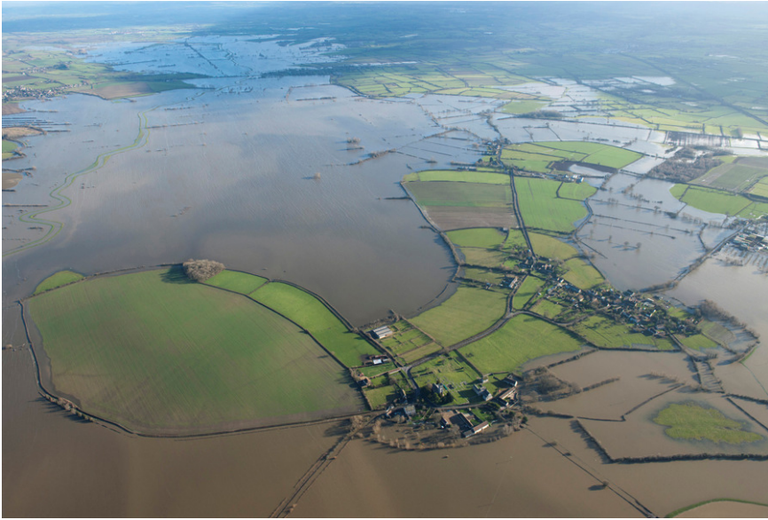
Muchelney surrounded by floodwater