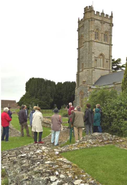
Muchelney Abbey and Church