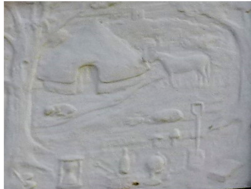
Plasterwork in Alcombe

Our first Hilary Binding Memorial Walk on 1 April explored Alcombe. After torrential rain the skies cleared for the start of our walk. We visited St Michael's church, which Hilary knew well and of which she wrote a short history. The church dates from the early 20th-century but includes a re-used medieval door from Dunster church and some fine modern artwork. We explored the interesting streets of Alcombe village, discovering a conduit for pure filtered water, unfortunately no longer used, and some quirky modern plasterwork.