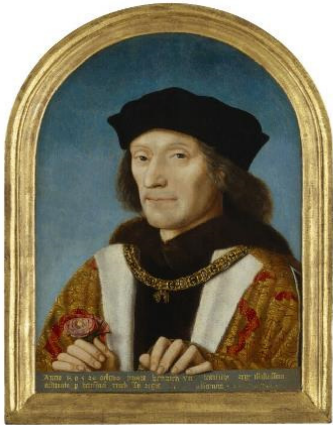
Henry VII (1457–1509) by an unknown Netherlandish artist, 1505. Oil on panel.

Through the generosity of the National Portrait Gallery in London, a remarkable portrait of Henry VII has been loaned for display at the Museum of Somerset in Taunton. Painted in 1505, it is the earliest work in the National Portrait Gallery's collection and may have been commissioned as part of unsuccessful plans for marriage between the widowed King Henry and Margaret of Savoy. The portrait's unknown artist came from the Netherlands and memorably captured Henry's lively intelligence as well as his reticent, avaricious and mistrustful character.