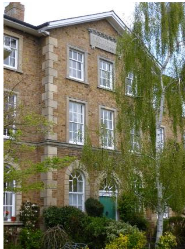
Front of main block, Taunton Workhouse

In common with many other Poor Law Unions during the early 1840s, the authorities at Taunton workhouse experienced difficulties in maintaining control of the inmates. Infringements included absconding from the workhouse, refusing to work, destroying workhouse clothing, fighting and using 'improper language'. Window breaking was another common way of letting off steam and this reached a peak in November 1845 when the master reported that there were 384 small and 4 large panes of glass broken in the windows of the workhouse. The most common punishment was to be locked up with a reduced diet, usually just bread and water for periods ranging from 12 to 48 hours. Birchings and whippings were also recorded and some offenders were taken before the magistrates.