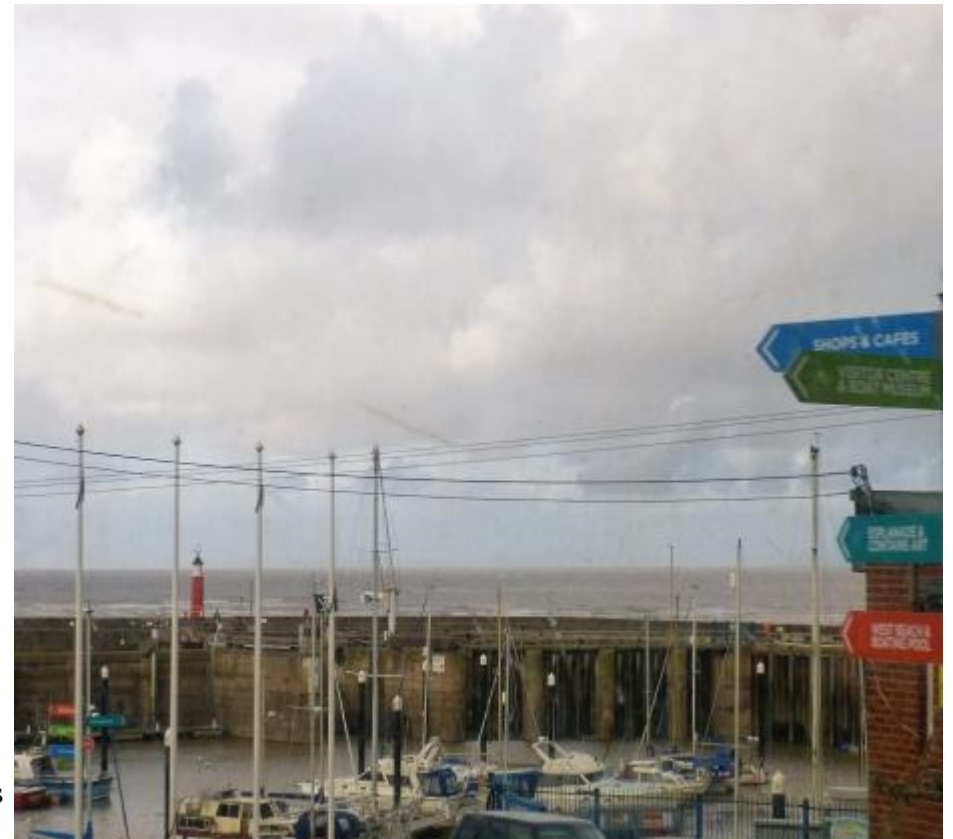
Storm over Watchet marina

The day after Storm Brian a few brave souls collected on the Esplanade for a brief tour of Watchet's industrial past. After a buffeting on the harbour where we saw the remains of mineral railway tracks and the great wall of Watchet with its 2016 mural. We moved inland and were fortunate to be standing on the old mineral line path when a train passed over the bridge above us. We saw the eerily silent buildings of the Wansborough paper mills whose closure is still keenly felt in the town and observed the many former employment sites now in residential use.