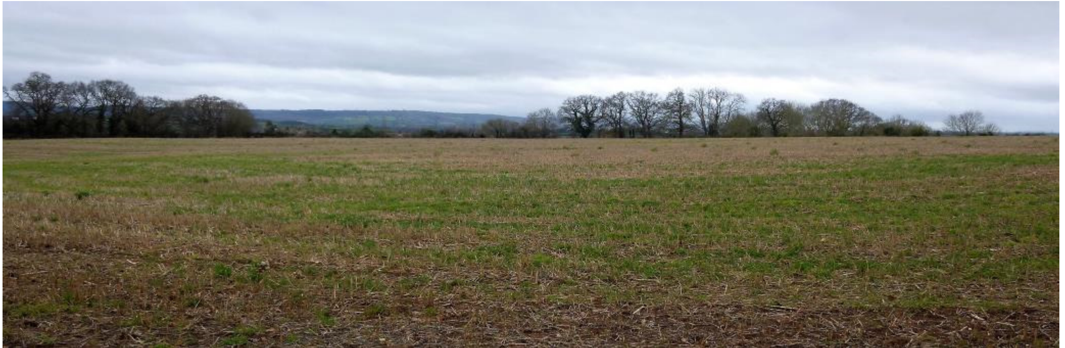
Looking across the centre of the hillfort to the Quantocks