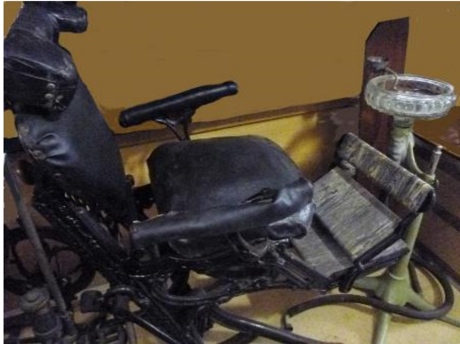
Early 20th-century dentist's chair from the SWHT collection Mary Siraut

By 1851 she had moved to premises in Fore Street to accommodate her nieces and two female cousin milliners from Devon. In the 1860s she was in Bridge Street and in the 1870s in Station Road practicing as a surgical and mechanical dentist; drawing and filling teeth and fitting artificial ones. By that date the foot-operated drill had been introduced as well as porcelain teeth, crown and bridge work and removable dentures, all developed during Julia's working life. Although local anaesthetics were only developed in the 1880s, ether was used for extractions from the late 1840s and nitrous oxide from the late 1860s.