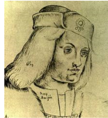
Perkin Warbeck (c. 1474–1499), from a later drawing

Henry has a special place in the history of Taunton Castle, home of the Museum of Somerset. It was there in 1497 that he confronted the rebel Perkin Warbeck. Warbeck said he was Edward IV's younger son, Richard, Duke of York, and England's rightful king. For six years many powerful people, including the King of Scotland, chose to believe him. Having reached Cornwall from Ireland, he arrived at Taunton on 20 September 1497 with a force 8,000 strong. But Warbeck fled when news reached him that the king's army was approaching. He was captured at Beaulieu Abbey and brought back to Taunton Castle to face King Henry in person. He admitted at once that he was an impostor, born at Tournai in Flanders, not a royal prince. The failure of Warbeck's rebellion was a key moment in Henry's reign. It ended the dynastic conflicts which had continued for almost 40 years and meant that the new Tudor monarch was at last secure.