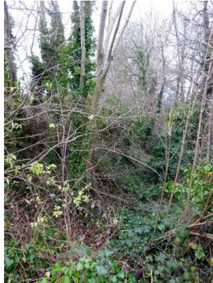
Above and opposite:

The most puzzling feature of the hillfort is the presence of three large, deep ravines which pierce the defences from different directions. Previously thought to be entrances the Langmaids it was concluded from pottery dating that they were the result of late mediaeval marl quarrying.