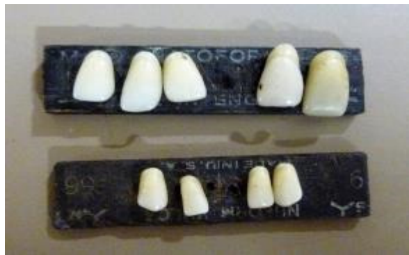
Early 20th-century English and American false teeth samples from the SWHT collection