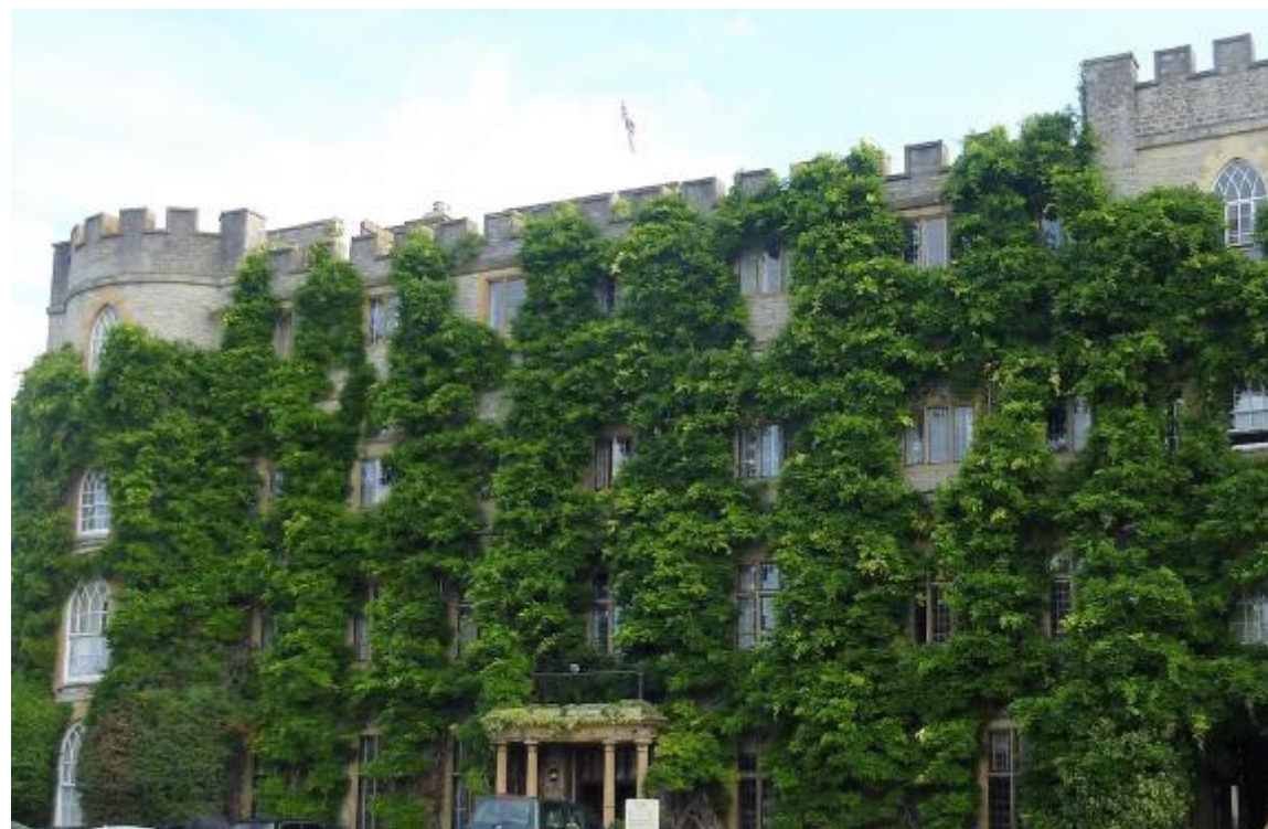
The Castle Hotel