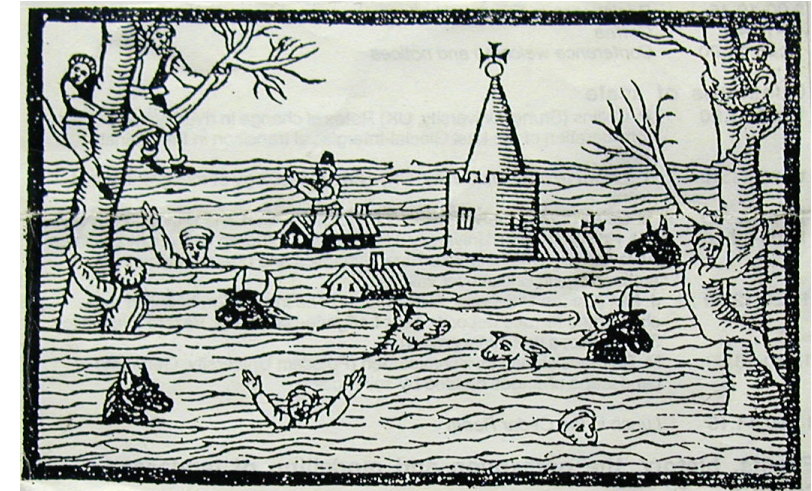
A woodcut of the 1607 flood

The ownership of much of the floodplain by ecclesiastical lords, including the Bishop and Dean of Wells and the Abbots of Glastonbury, Muchelney and Athelney,