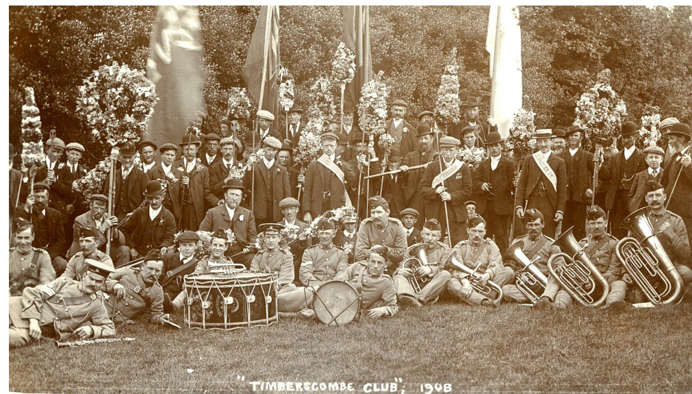
Timberscombe Club 1908.

Timberscombe Friendly Society was established in 1827 to provide men with the opportunity to provide for themselves and their families when they became ill or died. On the first Tuesday in June all healthy members within 15 miles of Timberscombe were to meet at 10 a.m. and process to church before enjoying a dinner at 2s 6d each. Membership declined from 130 in the 1890s to c.60 in the 1930s. For the club day there were flags, bought from Minehead Friendly Society in 1876, tents, a band and bellringing until 1939. The society survived until 1948 or later.