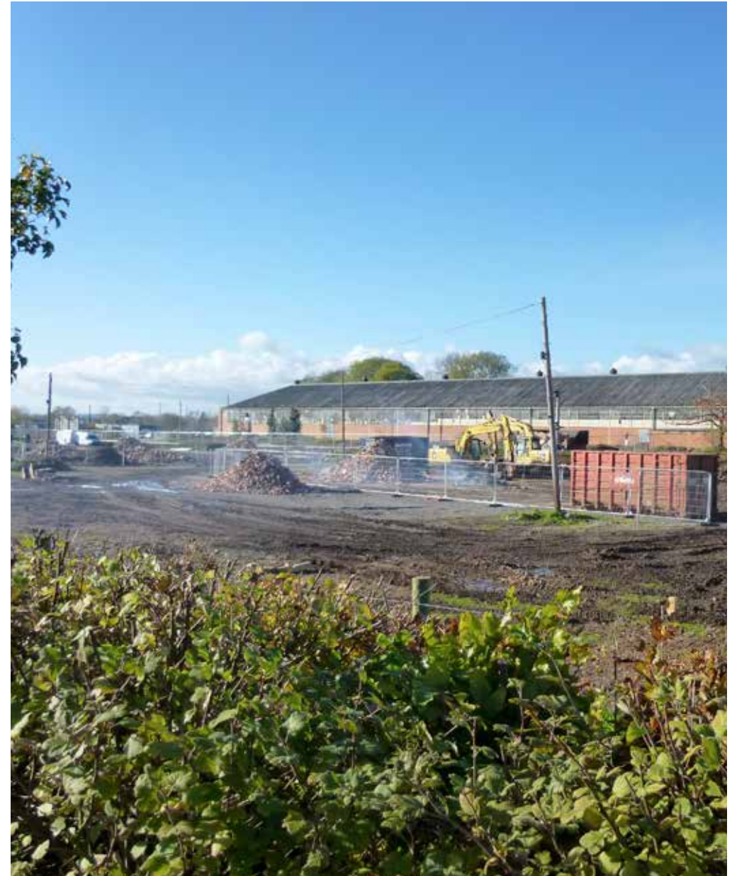
Gone 19 November; only one warehouse left standing

Now a further phase is under way as land is cleared for more housing and premises formerly occupied by hauliers were demolished. The buildings thrown up in a few months in 1940 have not fallen easily to modern demolition equipment!