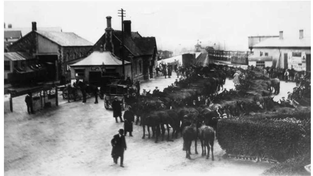
Mules at Minehead Station in c.1914.

From the 1890s North Hill at Minehead was used for annual military training, both for territorials and local yeomanry companies. In 1914 mules from Portugal were brought to the town to be trained for the front by their Portuguese handlers and, we are led to believe, by men from the West Somerset Yeomanry also camping in the area. Another photograph shows the mules trotting briskly up through Park Street. The mules were generally unbroken and many accidents occurred with injured men requiring nursing as a result.