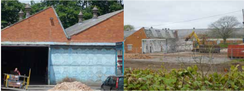
Hauliers' premises in 2010