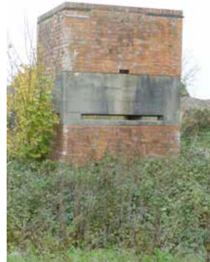
A surviving sentry post

This autumn has seen the end of an era in the neighbourhood of the Somerset Heritage Centre as World War II buildings were hammered into rubble and twisted metal.