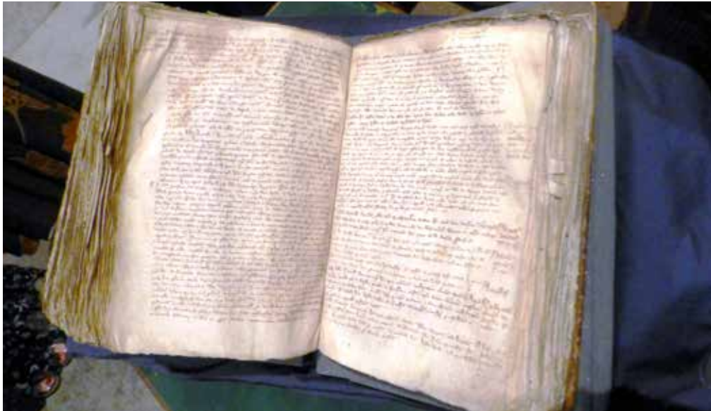
Register of Bishop Ralph of Shrewsbury open at the page that speaks of the 'pestilence and eastern plague'.

over the winter of 1348-9, when the plague was at its height in the county, and gave permission for laymen and women to hear the confessions of the dying.