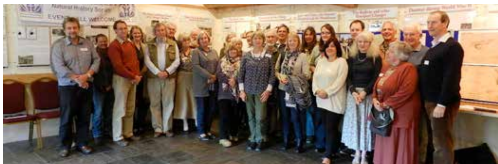
Dunster Building Workshop.

This has been a busy time, especially during October. The text for Timberscombe has been drafted and editing is complete so hopefully it will go on the website soon. This is the last parish planned for the Dunster and Minehead volume. Research has begun for the Carhampton hundred article involving going through voluminous court rolls. Much new material has gone up on the Explore website www.explore.englandspastforeveryone.org.uk and this may be the home of more material in future, as the draft volume needs drastic pruning to fit our new size guidelines from Boydell and Brewer our publisher.