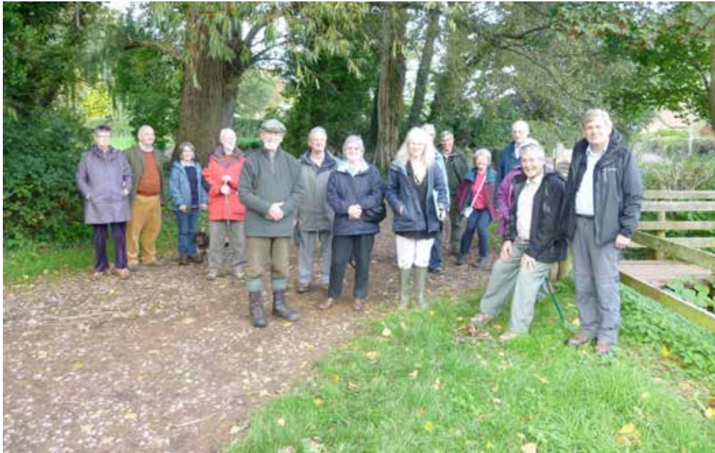
The Dunster History Walk near Gallox Bridge

On the 26th October we had our first VCH Somerset history walk looking at Dunster's 'lost' roads. There was great demand for the walk, which was fully booked shortly after publicity went out. We hope to give a programme of such walks next year, concentrating on less well-known aspects of West Somerset history. We have had some very positive feedback with many people wanting to do more walks and asking for suggestions about less well-known but historically interesting walks in the area.