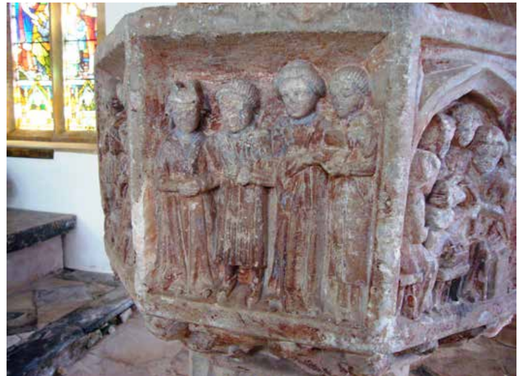
The marriage panel from the seven sacraments font at Nettlecombe

Both are available from the SANHS office at the Somerset Heritage Centre, Brunel Way, Norton Fitzwarren, Taunton TA2 6SF or online.