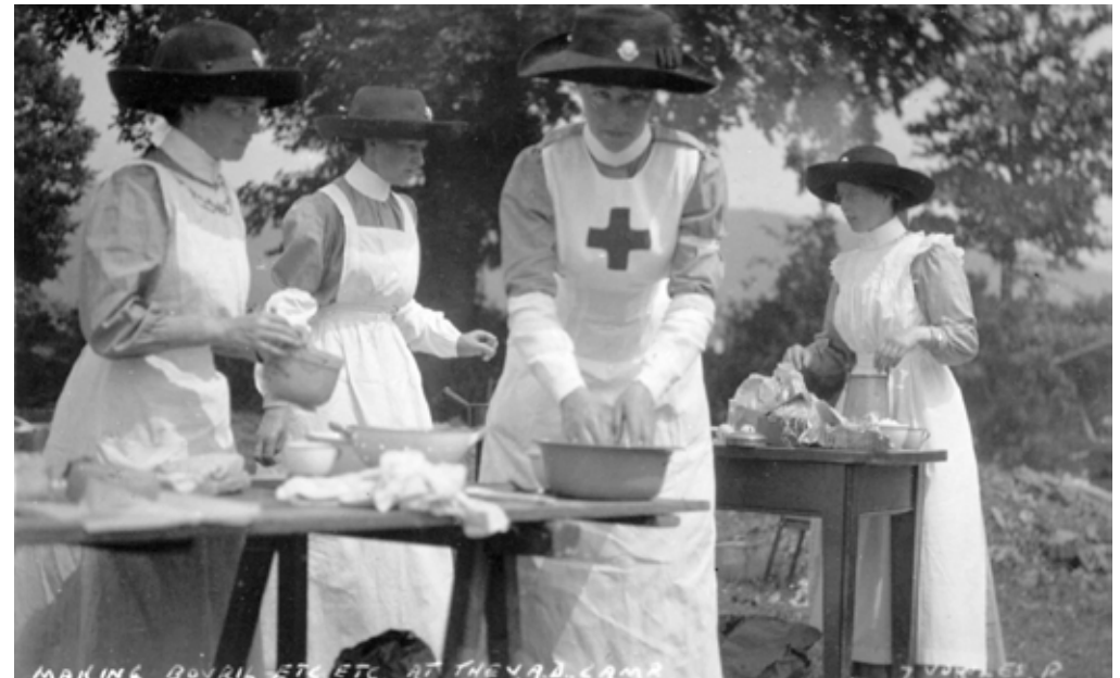
VADs making Bovril, etc, etc, at a training camp at Porlock c.1912